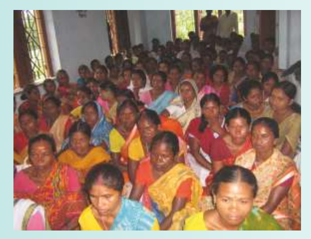
A meeting of SHG members