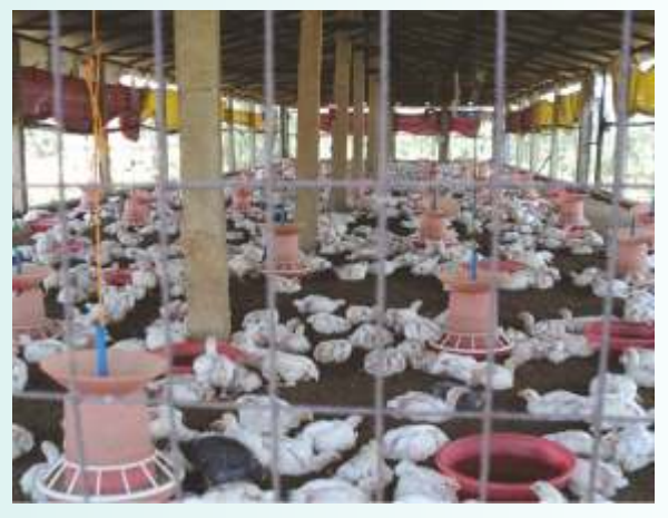
Broiler Farming by SHGs