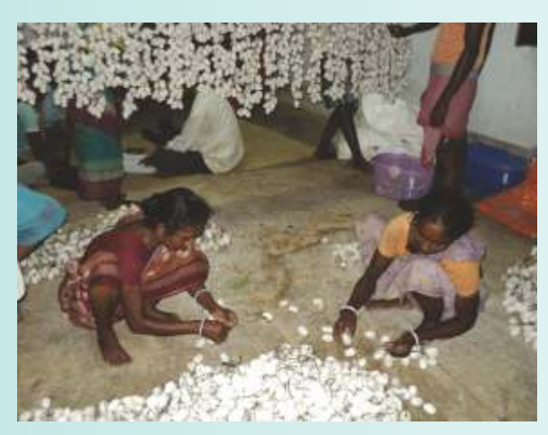
Garland making for Grainage operation