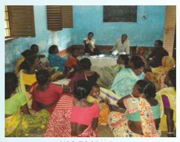
NBS EC Meeting