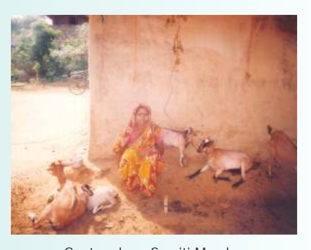
Goatery by a Samiti Member