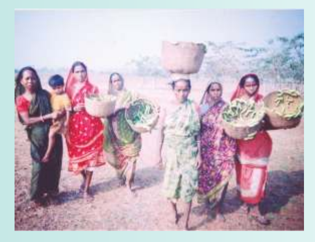
Transfer of Tasar larvae by Samiti Members