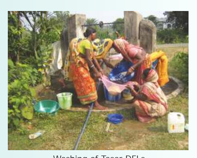
Washing of Tasar DFLs