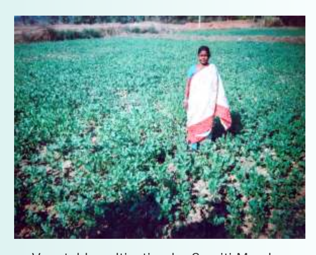
Vegetable cultivation by Samiti Member