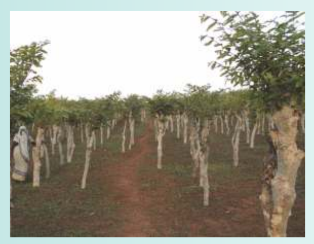
'First Flush in Tasar' Host Plants