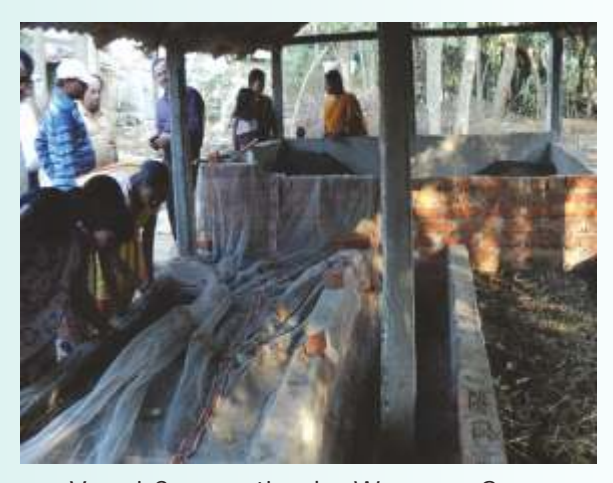
Vermi Composting by Women's Groups