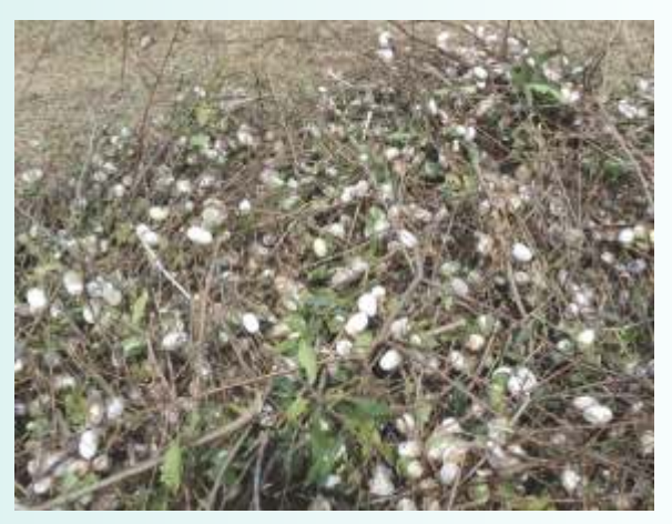
Harvested Tasar cocoon