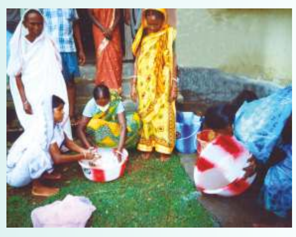
Samiti Members receiving Grainage Training